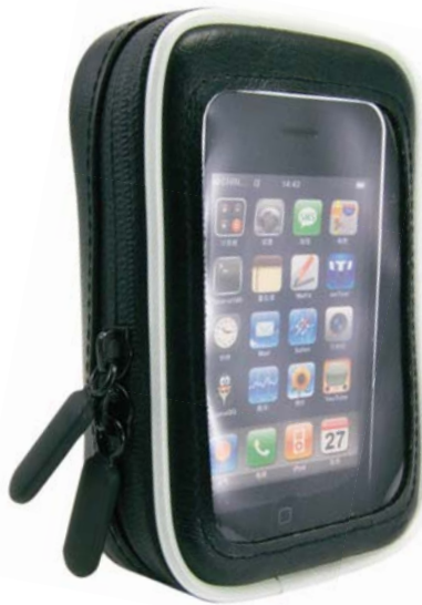
SM-WPCS Water-resistant Mobile Phone Case