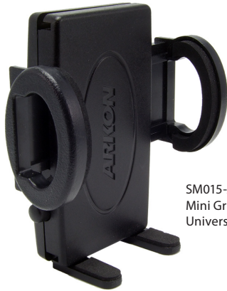
SM015-2-SLM Mini Grip Universal Phone Holder