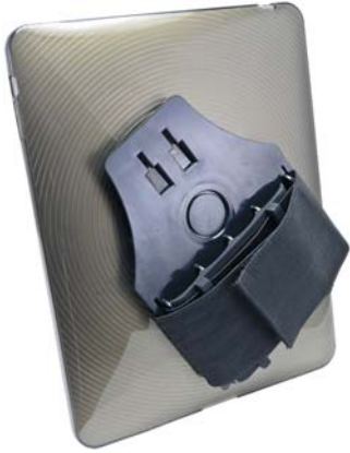
MHIP100 Integrated skin and hand holder for iPad original