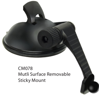
CM078 Multi Surface Removable Sticky Mount