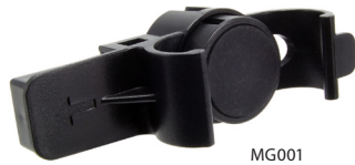
MG001 Mobile Grip Universal Smartphone Holder