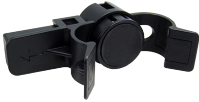
MG001 Mobile Grip Universal Phone Holder