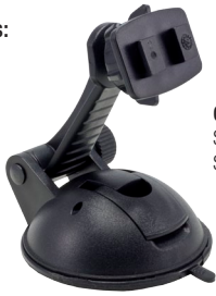
CM078-SBH Sticky Suction Surface Mount

1 Attach Mount to dash or windshield and engage Suction Lock Lever