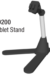
STAND200 10" Tablet Stand